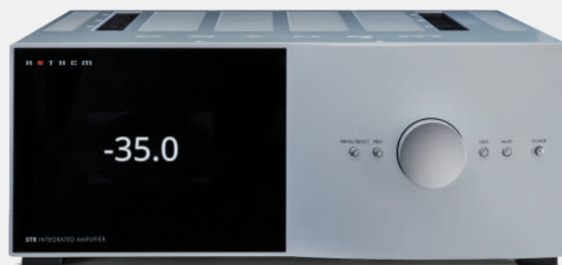
Available in both black or silver (as shown).